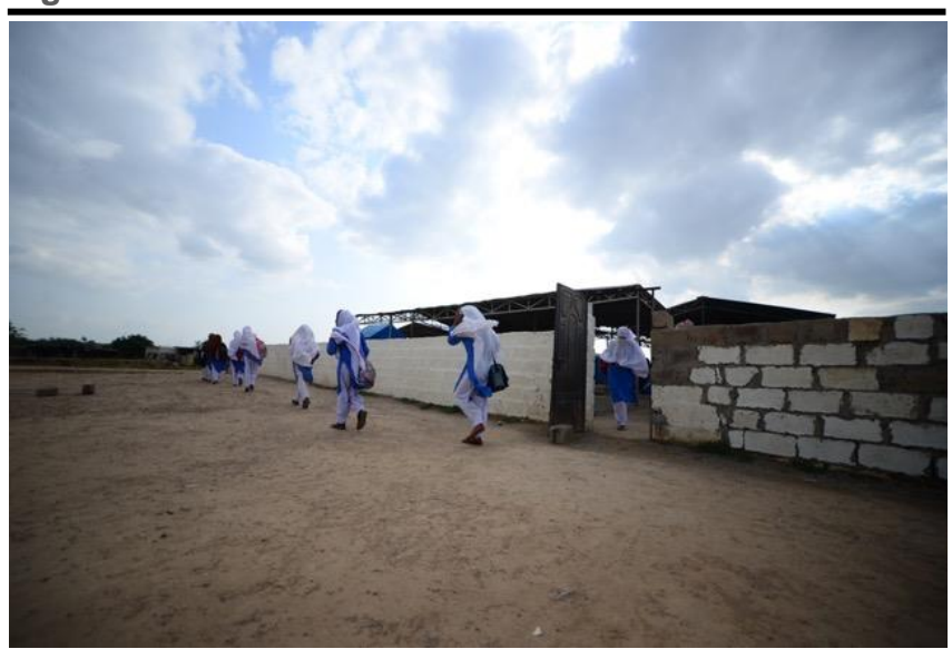
Female students leaving an open-air Pehli Kiran School.