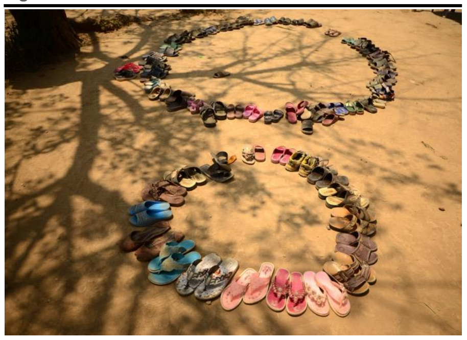
Figure 2: Non-Formal Education

Legal status affects refugees' ability to apply for educational opportunities. Even after decades of living in Pakistan, there are no laws for refugees, and the reliance on temporary international agreements makes their status insecure. The citizenship status of the second generation is still "Afghan," and there are no pathways to Pakistani citizenship.13 As a result, large numbers of unregistered refugees live under the official radar in Pakistan's cities, with little access to formal housing, sanitation, and education services.