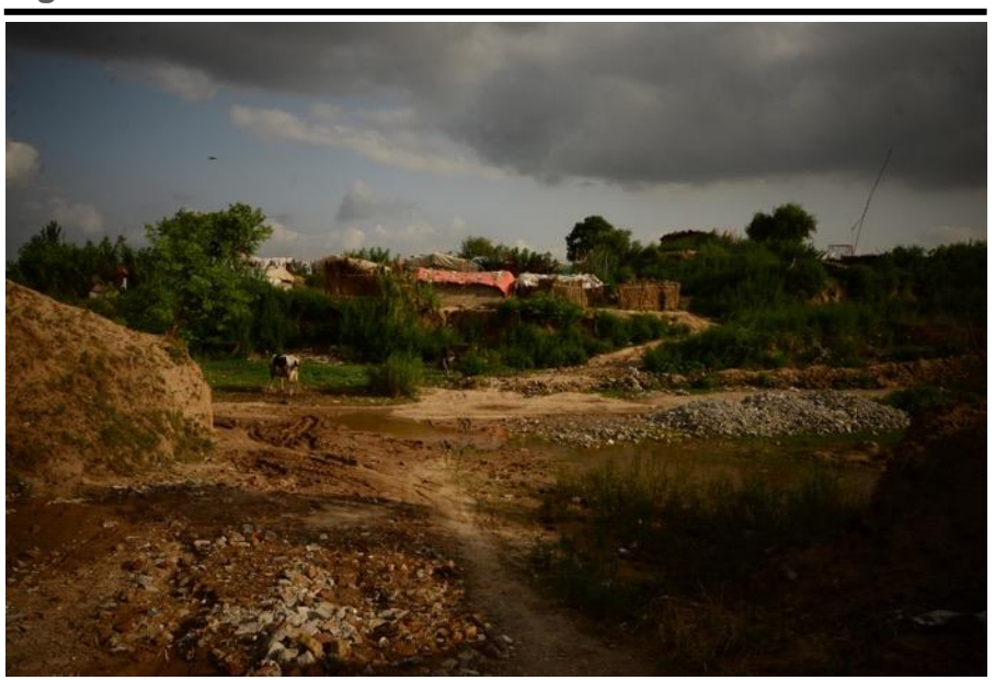
A "katchi abadi," or slum settlement.

The following stories and testimonies from young people illustrate the challenges for refugee education and integration in informal settlements or "katchi abadis."