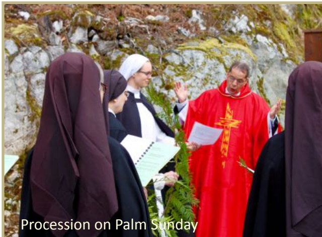
Procession on Palm Sunday