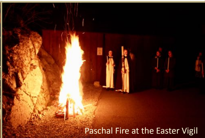
Paschal Fire at the Easter Vigil