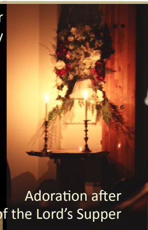
Adoration after the Mass of the Lord's Supper