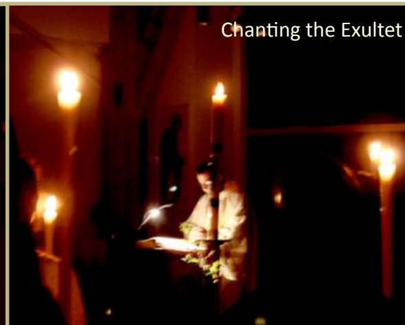
Chanting the Exultet