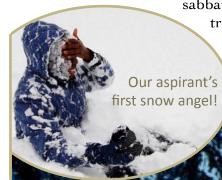
Our aspirant's first snow angel!