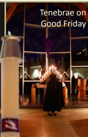
Tenebrae on Good Friday