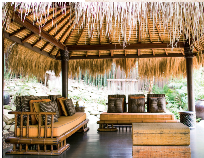
Top to bottom: A spot to dine alfresco; Goldberg designed the furniture in the MEDITATION PALAPA .