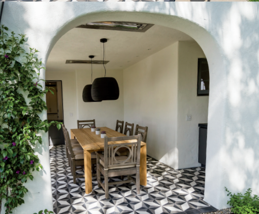
Top to bottom: The custom CONCRETE TILE FLOOR unites the OUTDOOR LOUNGING SPACE with the COVERED DINING AREA .