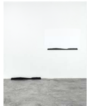
LEFT: Installation view of Foundation I, 2017. Solid graphite, 44 x 3 3/4 x 2 3/4 inches. RIGHT: Installation view of 1:1 Foundation I, No. 1 (rear profile) @The Drawing Center, 2017. Graphite pencil on paper, 32 1/8 x 42 inches.