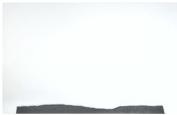
1:1 Foundation I, No. 1 (rear profile) @The Drawing Center, 2017. Graphite pencil on paper, 32 1/8 x 42 inches.