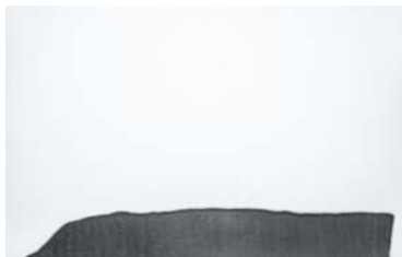
1:1 Foundation III, No.1 (rear profile) @The Drawing Center, 2017. Graphite pencil on paper, 32 1/8 x 42 inches.