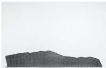
1:1 Foundation II, No. 1 (rear profile) @The Drawing Center, 2017. Graphite pencil on paper, 32 1/8 x 42 inches.

All works are by Susan York and courtesy of Del Deo & Barzune, New York and Exhibitions 2d – Marfa.