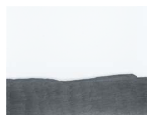
Detail of 1:1 Foundation III, No.1 (rear profile) @The Drawing Center, 2017. Graphite pencil on paper, 32 1/8 x 42 inches.