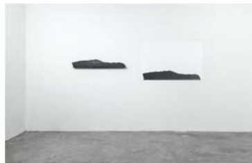
LEFT: Installation view of Foundation II, 2017. Solid graphite, 48 x 8 x 5 inches. RIGHT: Installation view of 1:1 Foundation II, No. 1 (rear profile) @The Drawing Center, 2017. Graphite pencil on paper, 32 1/8 x 42 inches.