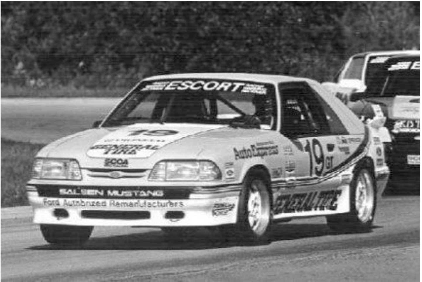
In the Saleen Mustang.