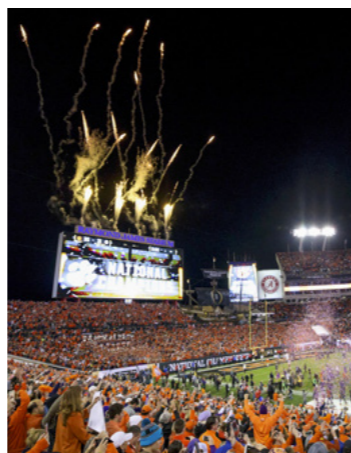
ROB HIGGINS TAMPA BAY SPORTS COMMISSION

They immerse themselves in every aspect of a project and the results have been far beyond our expectations. Crackerjack Media continues to help our community and our team shine on the biggest of stages.”