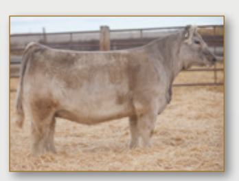
A Troubadour daughter that sells in this offering. Sells at Lot 95

This is one of the most unique cows that I have ever owned...And is the softest and chubbiest Troubadour in existence. This silver female is the right size, the right kind and the right color... She will make Breeding Cattle or Show Steers with equal ease, for haired or slick shearing country. 3121 Is a beautifully balanced female that is stellar in her lines and striking from the profile. This is a wide based, thick ended, square hipped female that is absolutely massive bodied. The upper rib shape, rump design and build of her top is unmatched. The structural design and mobility of this great female are what puts her in a class by herself. She is perfect from the ground up and the freest wheeling cow I have ever seen...She actually walks and trots with a spring in her step. She has been flushed four times and produced an average of 21 Transferable Embryos per flush. She sells open and ready to flush and is guaranteed to produce. She will have a cidar in her sale day so that we can get a start heat and get to making eggs.