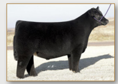
Son of SAK Summit and Service Sire of Several Lots

It is a rare opportunity to find Summit progeny and these two Summit daughters are truly peas in a pod. If you're looking for power, this is the one for you. Super stout in her muscle expression and big boned. Good haired, big bodied and easy keeping - this heifer truly has presence and eye appeal.