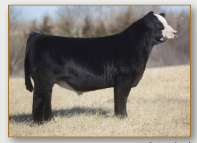
WS Revival Service Sire to Lot 55

A PICTURE IS WORTH A THOUSAND WORDS... This exceptional Future Donor has the WOW FACTOR! She comes with the Diamond B brand on her front shoulder and I couldn't be more proud of her. I know this Female will be a Cornerstone to any program. Big backed, wide based, with the perfect blend of power and balance. When you get to her running gear. She has plenty of flex when put into motion, Stands on plenty of pipe and a big foot. We have been very successful mating Revival to our Chi's and Maines. I expect her first Revival to do big things.