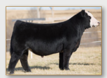
On The Mark Service Sire of Lot 2

I absolutely LOVE this baldy Simmental Cow. She is a model brood cow in a lot of ways...excellent uddered, heavy milking, easy fleshing, breeds back on the first service every time and consistently weans the best calves on the place. As you can see she is incredibly deep bodied, bold sprung, capacious creature that stays in the condition she is in the picture ALL THE TIME. She is great balanced, pretty fronted cow with a beautiful Baldy Head...And every calf she has ever had out of a Baldy bull is marked just like momma. She has several daughters by Wide Open at the ranch that you don't have to read there tag to identify, they look just like her. I am anxious to see the litter of Loaded Up calves we have coming this Spring. After we flushed her that way I thought why not try On the Mark. Brad Smith and Grizz have got a lot of good things to say about him. She has been flushed twice and averaged 9 Transferable Embryos. I think this young cow can make a significant long term contribution to the Simmental Breed. She will be registered 1/2 Simmental.