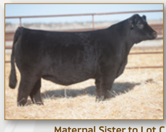
Maternal Sister to Lot C Sells as Lot 58