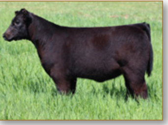
A Bullseye Daughter

A STRIKING PUREBRED SIMMENTAL FEMALE BUILT WITH CLASS! Coalette is elegant in her front one third, I Love the way her neck comes out of the top of her shoulder, she blends perfectly from front to rear. She is level in her design, stands on big feet, with plenty of bone. Big and sappy through her center body, athletic on the move, with a great disposition. The Uprising x Built Right combination works time and time again. Regardless of what segment of the industry you are in, when you lay eyes on Coalette, she is Unforgettable. Bred to W/C Bullseye for a Purebred Simmental calf the MATERNAL VALUE on this one is THROUGH THE ROOF!