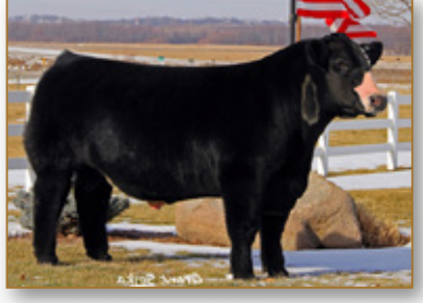
SAK Summit Sire of Lots 60 & 61