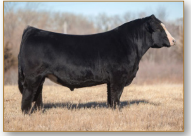
LLSF Uprising Z925 Sire of Lot 56

BSC • 692D • Black Baldy • Spring 2016 • 5/8 Simmental SIRE: LLSF Uprising Z925 (ASA# 2646300) • DAM: OCC Jupiter x Built Right Bred 5/13/17 Daddy's Money (AMAA#427013) Double Clean • Safe AI