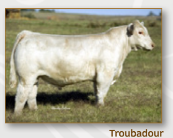
Service Sire to Lot 15

We all know that both Troubadour and Exit 174 semen is hard, if not impossible to find...AND ON JANUARY 13 YOU GET A CHANCE OWN A GREAT BULL THAT TIES IT ALL TOGETHER. This young White Bull is as near perfect balanced, clean made, smooth built and structurally correct as you will find anywhere!!! He has got excellent rib and top shape, a big square hip and a killer hind leg. He is a good haired calf that reads so strong, correct and stunning from any angle. REMEMBER HE IS A TROUBADOUR OUT OF A FULL SISTER TO EXIT 174