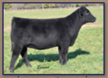
.... DAMERON Lucy 5119 .... Full sister to dam of Lot 15.

• A powerful January show heifer that is a direct daughter to past ROV Sire of the year, EXAR Classen 1422B, and back to the popular Enchantress family. She is a deep, massive, eye appealing daughter of the featured SHIKE Enchantress 493B and has what it takes to compete at every level.