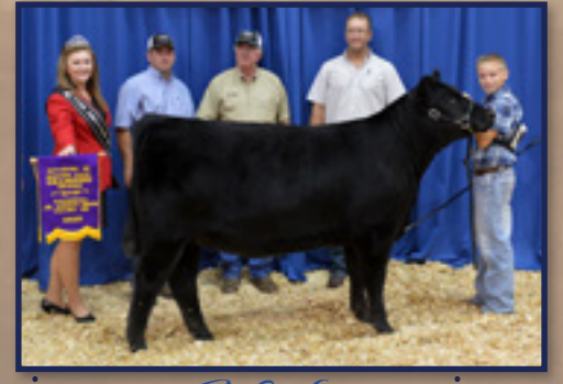
DAMERON Fr Sandy 4180 .... Dam of Lot 38.