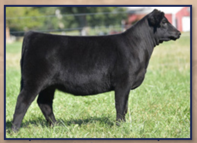
She sells as Lot 40.