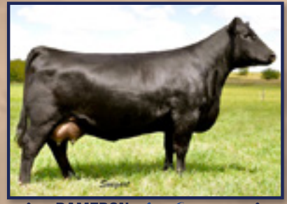
···· DAMERON Bardot