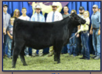
..... DAMERON 8 lsa 7165 .... Full sister to Lot 10.

• Full sister to the dam was the 2013 North American Grand Champion and the 2014 All-American Breeder's Futurity Supreme Champion. • Full sisters include Dameron Elsa 705, the $85,000 Res. Early Jr. Champion of the 2018 Eastern Regional Jr. Show, the Early Jr. Champion Female of the 2018 Illinois Junior Field Day, the Early Jr. Heifer Calf Champion of the 2018 Central Illinois Jr. Preview; the $45,000 selection of Colburn Cattle Company of California, Dameron Elsa 708; the 2018 Res. Grand Champion Female of the Phenotype and Genotype Show, Dameron Elsa 7144; and the 2018 Grand Champion Female of the Phenotype and Genotype Show, Dameron Elsa 7120.