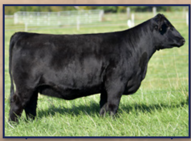
• DAMERON AF Proven Queen 8838 •• She sells as Lot 69.

Bred to calve January 24, 2020 to STEVENSON TURNING POINT. Exposed to Dameron Scottsdale from June 21, 2019 through September 13, 2019. Examined safe to AI date.