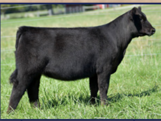
····· DAMERON C-5 Chegenne 1933 ·· She sells as Lot 25.

A direct daughter of Colburn Primo 5153, one of the hottest bulls in the breed and full brother to the 2016 National Junior Show Grand Champion, and full sister to one of the all-time great females produced in the program and the $65,000 past feature, Dameron C-5 Cheyenne 1628 who is the mother of Lots 17 through 22 and one of the dominant show heifers in the summer of 2017 being named the 2017 Illinois State Fair Champion, Res. Grand Champion Female of the 2017 Eastern Regional Jr. Show, Grand Champion Female of the Central Illinois Preview Show and the Owned Res. Late Spring Heifer Calf Champion of the Atlantic National Junior Show as well as the 2018 Reserve Jr. Champion of the NWSS. lot