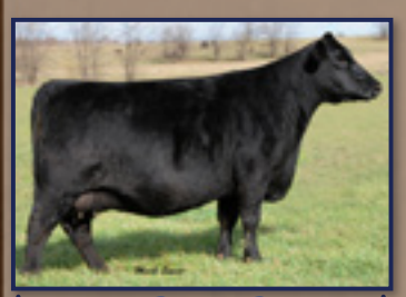
··· DAMERON Northern Miss 3114 ···· Dam of Lot 58.