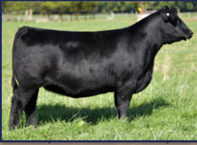
••• DAMERON Primrose 860 •• She sells as Lot 53.

Bred to calve January 24, 2020 to STEVENSON TURNING POINT. Exposed to Dameron Scottsdale from June 21, 2019 through September 13, 2019. Examined safe to AI date.