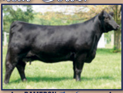
···· DAMERON Bardot 689 ····