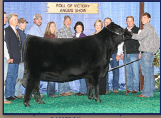
Full sister to the dam of Lot 64.

• Bred to calve January 24, 2020 to STEVENSON TURNING POINT. Exposed to Dameron Scottsdale from June 21, 2019 through September 13, 2019. Examined safe to AI date.