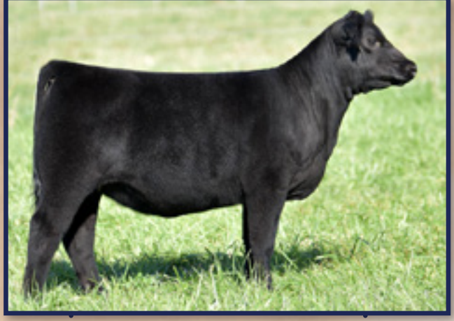
She sells as Lot 39.