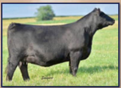
···· DAMERON Primrose 659 ··