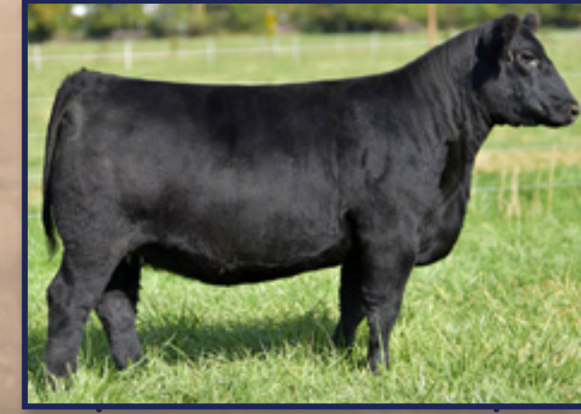
••••• DAMERON Northern Miss 840 ••• She sells as Lot 63.

Bred to calve January 24, 2020 to STEVENSON TURNING POINT. Exposed to Dameron Scottsdale from June 21, 2019 through September 13, 2019. Examined safe to AI date.