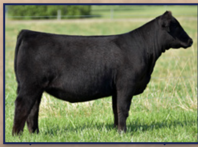
•••• DAMERON C-5 Chegenne 909 ••• She sells as Lot 20.