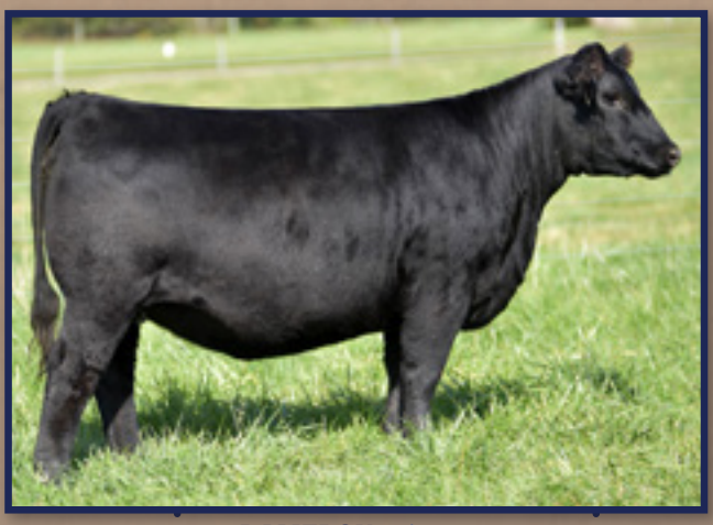
Second DAMERON Suppress 888 •••• She sells as Lot 54.

Bred to calve January 24, 2020 to STEVENSON TURNING POINT. Exposed to Dameron Scottsdale from June 21, 2019 through September 13, 2019. Examined safe to AI date.