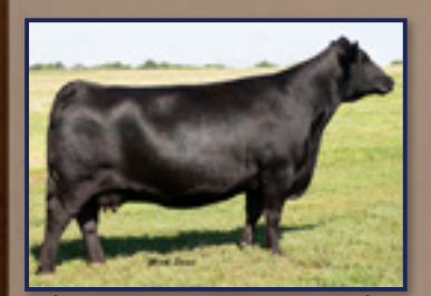
····· 2K Black Lady 839 ···· Dam of Lot 30.