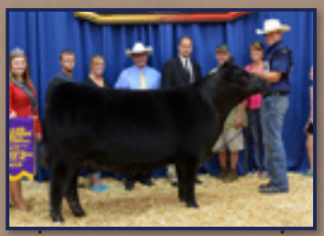
:....DDA The 2015 Grand Champion Bred & Owned Female and full sister to Lots 1 and 2.