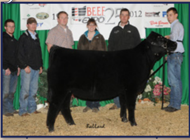
····· DAMERON SRA Bride 1144 ···· Dam of Lot 68.

American Sire of the Year and Pathfinder Sire, Leachman Saugahatchee 3000C. This female ranks in the top 25% of the breed for weaning, and top 35% for