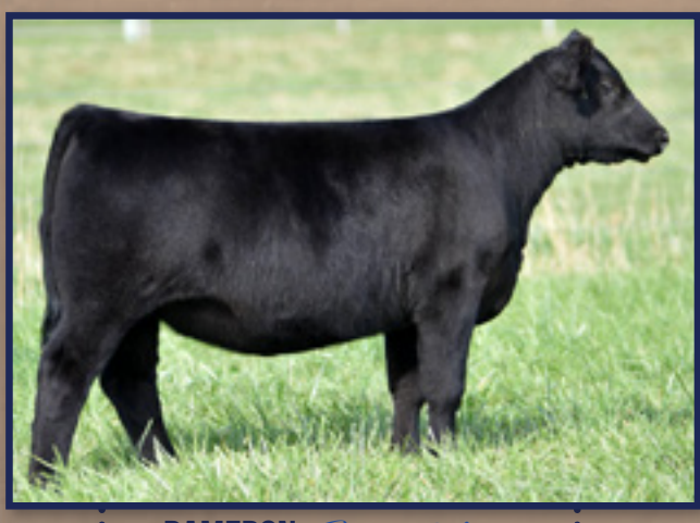
She sells as Lot 41.