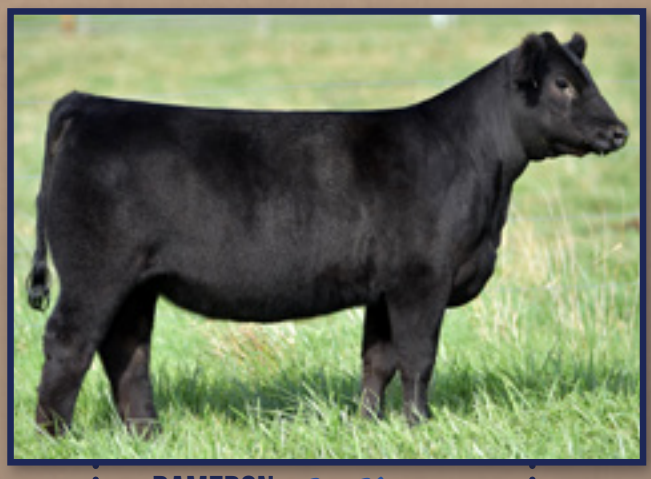
She sells as Lot 21.

A beautiful February prospect by S&R Roundtable J328, a many-time champion that stems from a dam that was selected as the $65,000 feature through the 2016 sale and went on to be the 2017 Ilinois State Fair Champion, Res. Grand Champion Female of the 2017 Eastern Regional Jr. Show, Grand Champion Female of the Central Illinois Preview Show and the Owned Res. Late Spring Heifer Calf Champion of the Atlantic National Junior Show as well as the 2018 Reserve Jr. Champion of the NWSS.