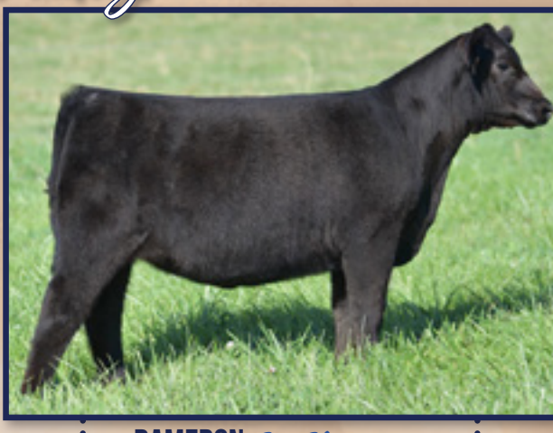
••••• DAMERON C-5 Chegenne 9120 •••• She sells as Lot 24.

time great females produced in the program and the $65,000 past feature, Dameron C-5 Cheyenne 1628, who is the mother of Lots 17 through 22 and one of the dominant show heifers in the summer of 2017 being named the 2017 Illinois State Fair Champion, Res. Grand Champion Female of the 2017 Eastern Regional Jr. Show, Grand Champion Female of the Central Illinois Preview Show and the Owned Res. Late Spring Heifer Calf Champion of the Atlantic National Junior Show as well as the 2018 Reserve Jr. Champion of the NWSS.