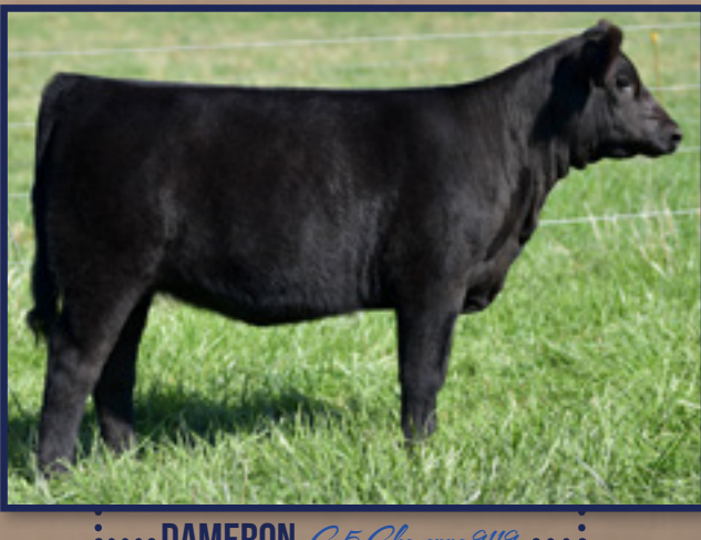
·· DAMERON C-5 Ch enne 9119 •• She sells as Lot 26.

A beautiful April prospect by S&R Roundtable J328, a many-time champion that stems from a dam that was selected as the $65,000 feature through the 2016 sale and went on to be the 2017 Illinois State Fair Champion, Res. Grand Champion Female of the 2017 Eastern Regional Jr. Show, Grand Champion Female of the Central Illinois Preview Show and the Owned Res. Late Spring Heifer Calf Champion of the Atlantic National Junior Show as well as the 2018 Reserve Jr. Champion of the NWSS