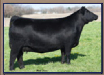
DAMERON C-5 Northe Dam of Lots 7 and 8. Miss 1406 .: