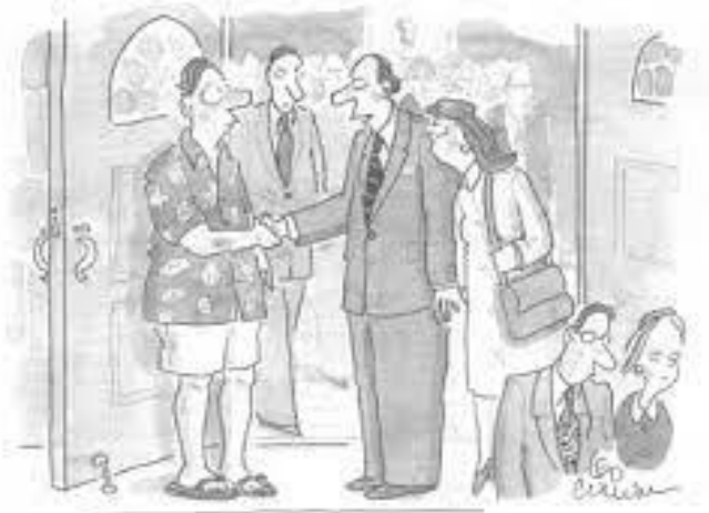
"Loved the sermon. Hated casual Sunday."