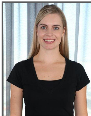
10cms x 15cms or 4" x 6"