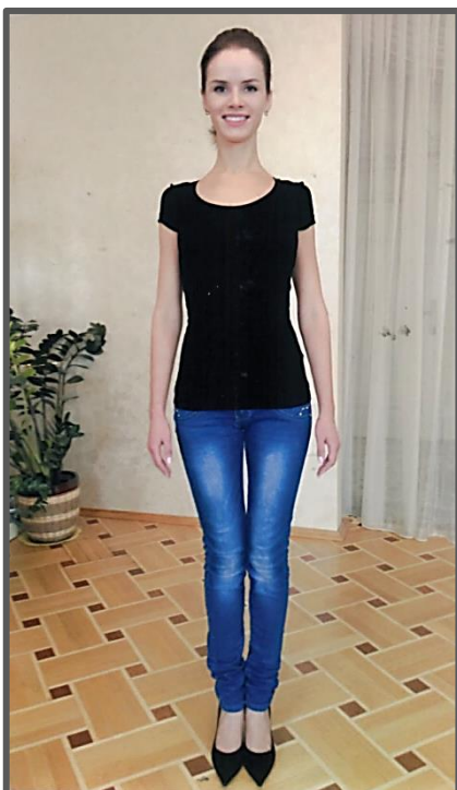
10cms x 15cms or 4" x 6"

1x full length (standing, photo from head to toe) and 1x close up (standing, photo from head to waist) casual photos. Please refer to the photos below. Your attire and surroundings should be conservative and reflect your professional image. You must be standing up, straight, facing the camera, hands flat by your side with you hair behind the ears and shoulders.