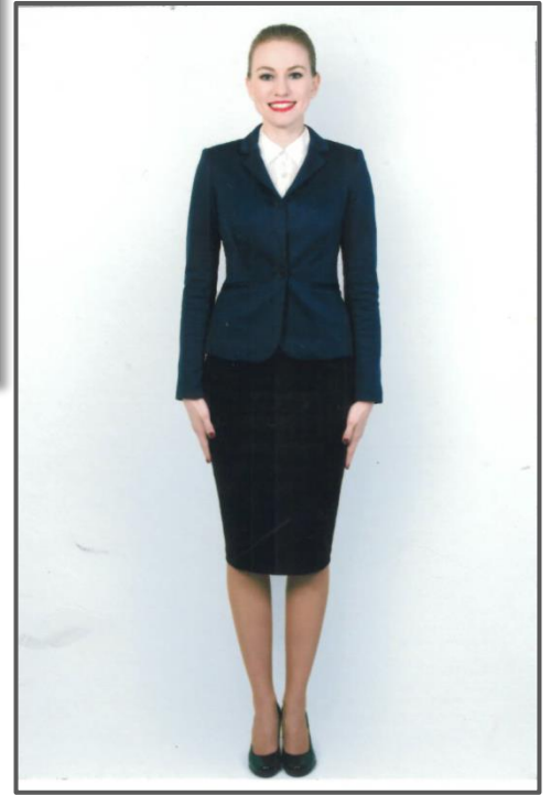
10cms x 15cms or 4" x 6"