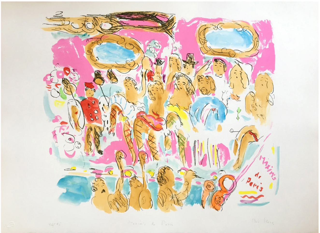
Maxim's de Paris