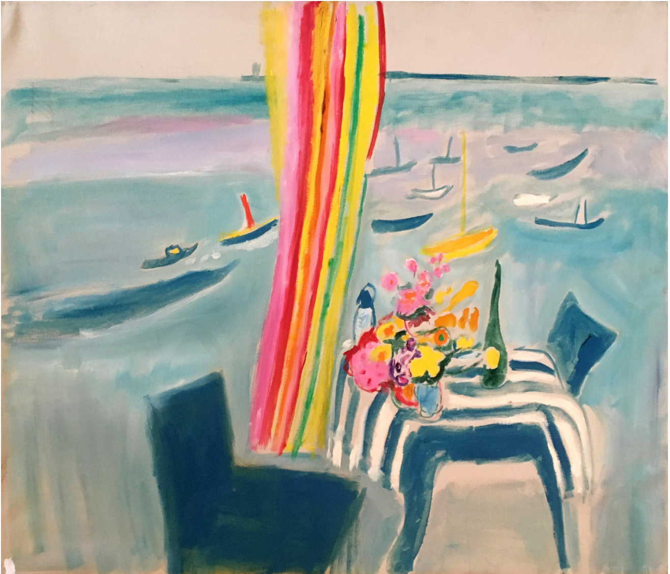
Terrace Positano, 2002