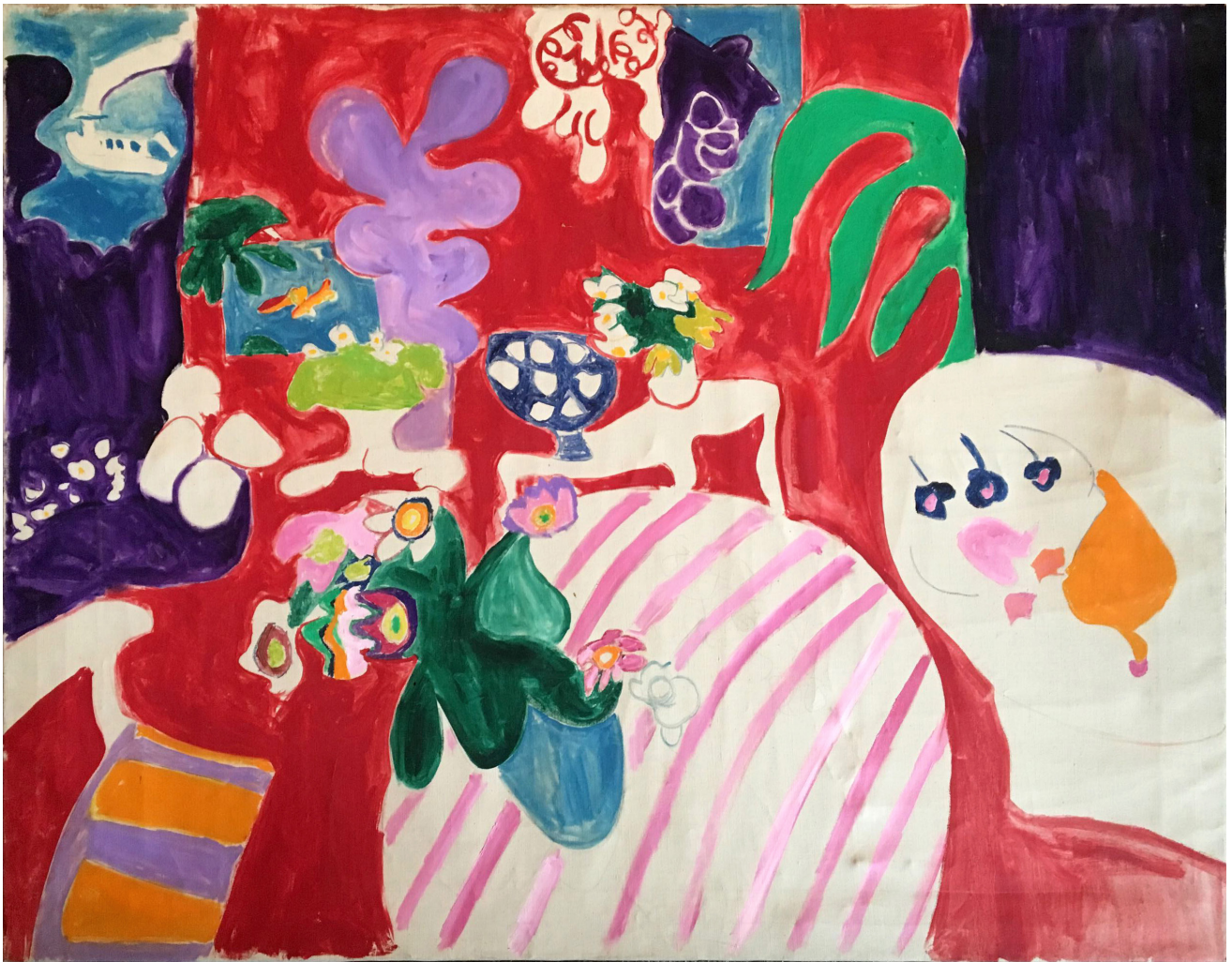
Abstract Flowers , 1968