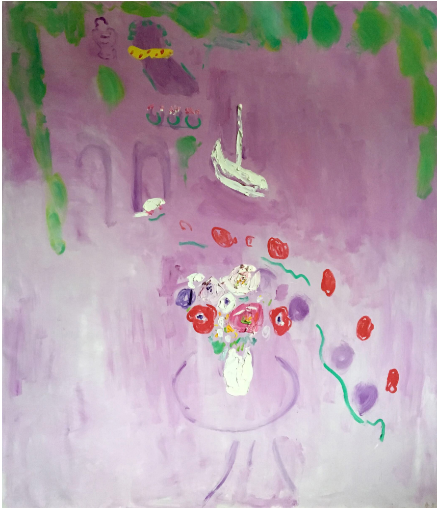
Villa L'Incanto (The Enchanted) Positano II , Oil on linen, 57 ¾ x 50 in

“Bob loved to paint, we found paintings behind the dresser, the kitchen cabinets, and in the closet; we even found paintings stretched over other paintings!” - Glenn Macura