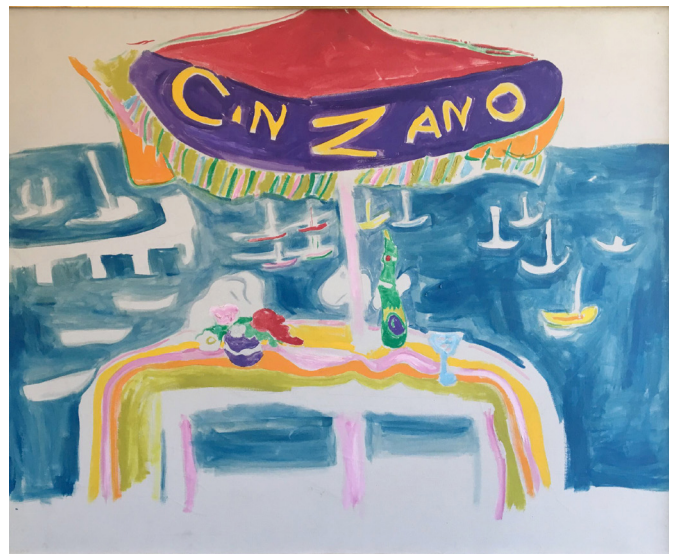
Cinzano (Provincetown) , Oil on linen, 37 ½ x 45 ½ in

“Bob loved to paint, we found paintings behind the dresser, the kitchen cabinets, and in the closet; we even found paintings stretched over other paintings!” - Glenn Macura