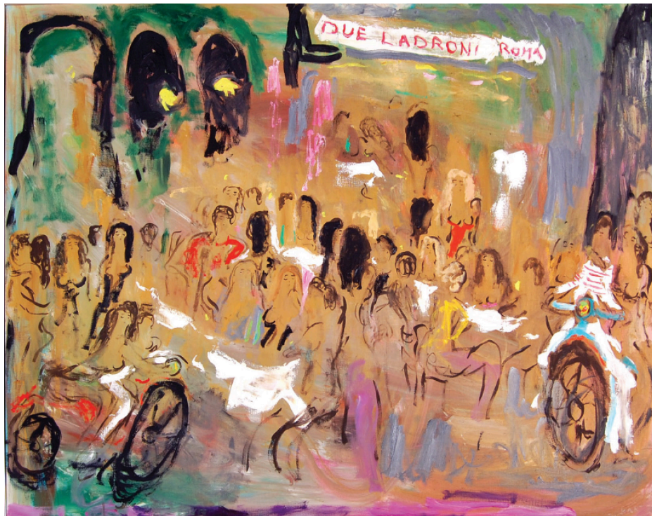
Restaurant of Two Thieves