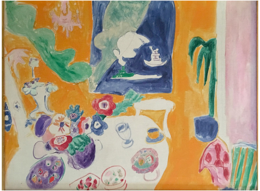
Untitled #2 (Strawberries & Anemones) Oil on linen, 21 x 27 in