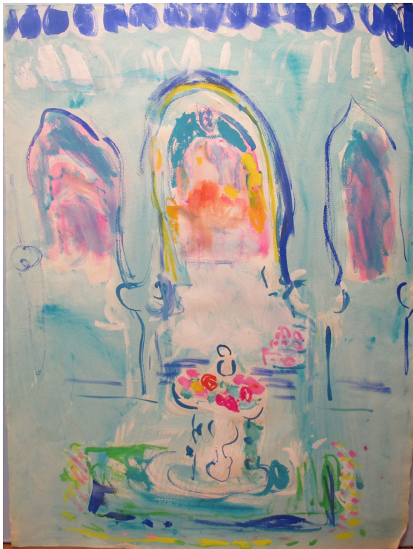
Moroccan Fountain WC on paper, 30 x 22 in