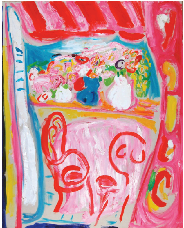
Terrace Cannes Oil on linen, 51 x 40 in