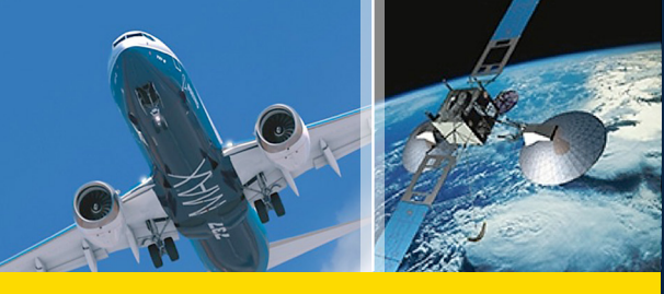
It's personal-for you and for us.