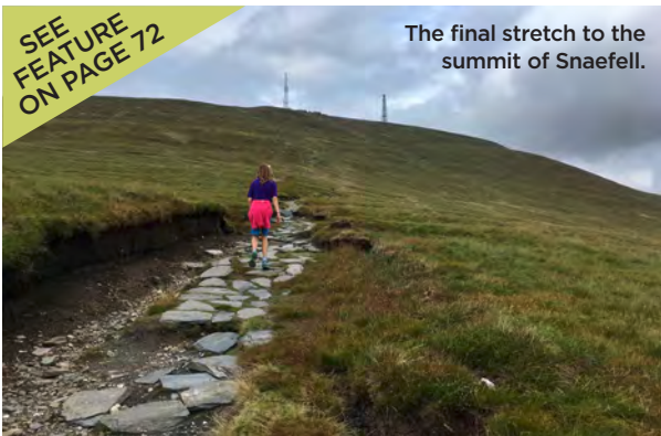
The final stretch to the summit of Snaefell.