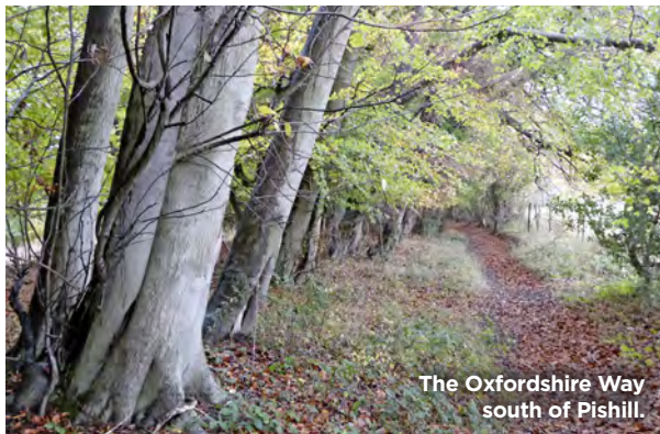
The Oxfordshire Way south of Pishill.