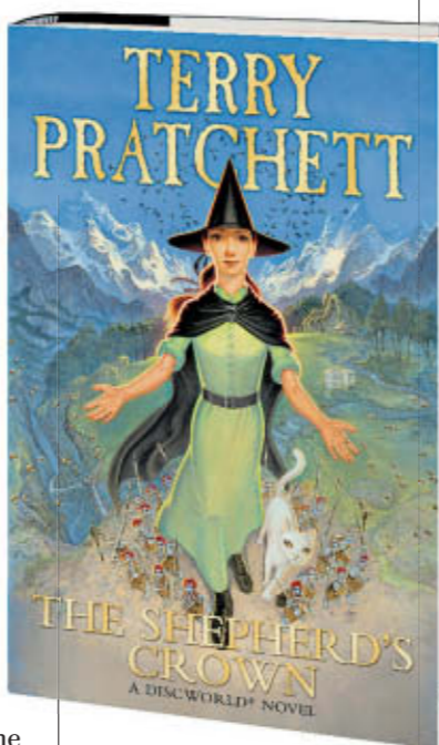
Terry Pratchett, top. The Shepherd's Crown is published by Doubleday, £20