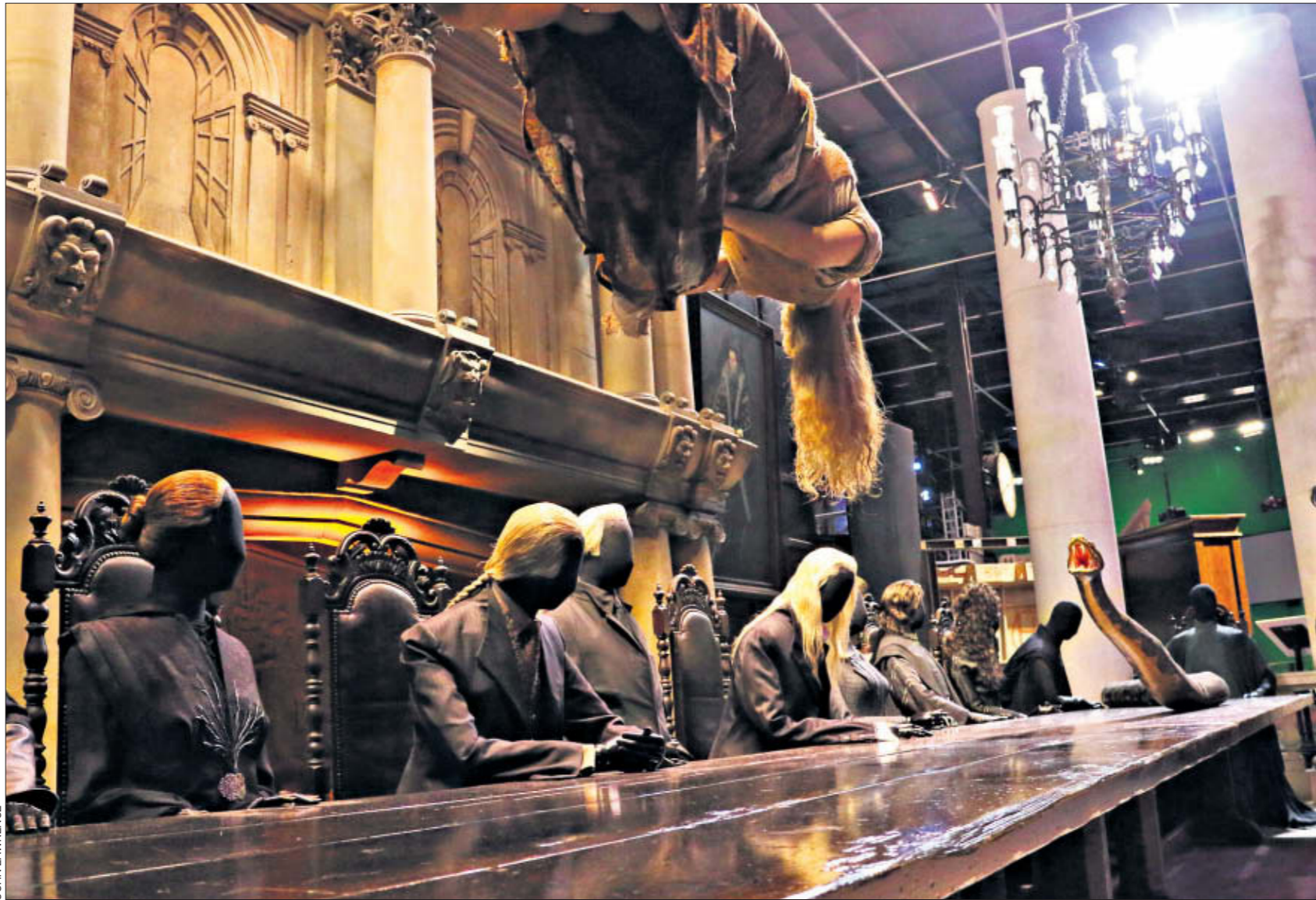
Death Eaters seated around the table at the Malfoy Mansion, with a Hogwarts professor suspended above; Voldemort's statue in the Ministry of Magic; Umbridge's pink Xs on her enemies; the snake Nagini

The Dark Arts exhibit, like the wider tour, is a show of imagination, creativity and talent. The Horcruxes, items where Voldemort stored parts of his soul, are