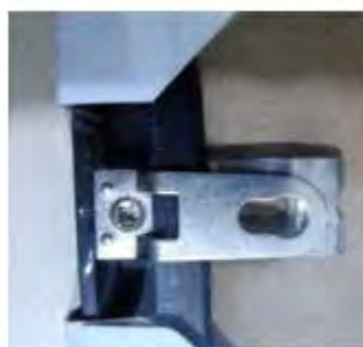
Metal Frame w/adjustable D-Ring