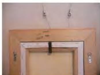
WOOD FRAME with D-RINGS

Display Requirements: All work must arrive at the gallery with a label on back, ready to install. Accepted work that differs significantly from the entry images will be disqualified. Gallery walls have wires & hooks that hook into the D-Rings or Screw eyes on the back of your work. All work MUST have 2 D-rings or screw eyes attached on the back, one on either side (usually no further than 2 inches down from the top of the piece - use your judgment considering the weight of your work so that the top of you work will not hang far from the wall). The heavier your frame, the higher your rings should be. Screw eyes or rings must have at least ¼ inch opening for our hooks to fit in. The Mills Pond House Gallery is in an historic building. We have plaster walls –absolutely no nails, screws, etc. are allowed on walls to display work. Please do not wire the frame. We do not use wire to hang work.