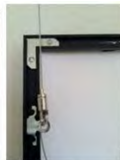
Metal Frame with Sliding D-Ring