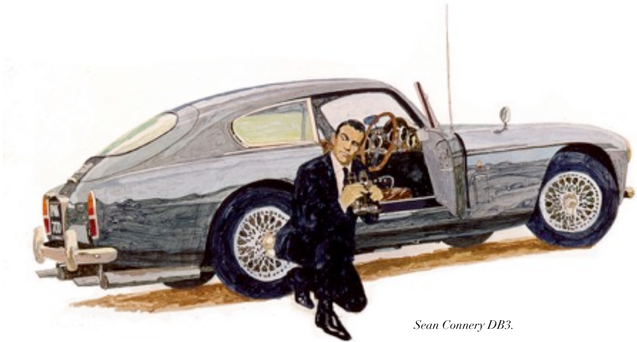
Sean Connery DB3.