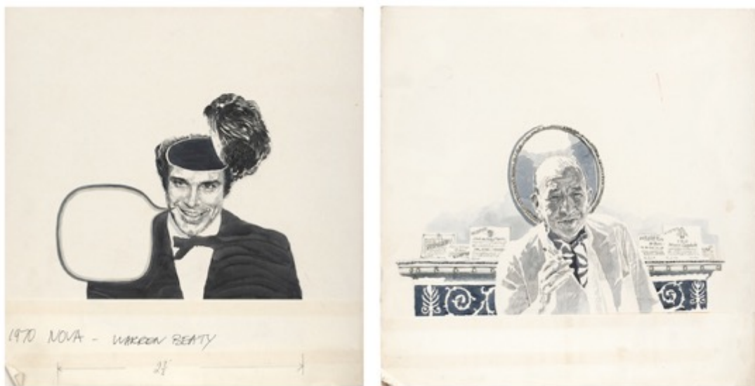
L-R Warren Beatty, Noel Coward.