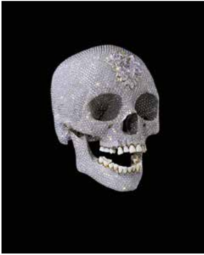
Damien Hirst's Diamond Skull "For the Love of God"