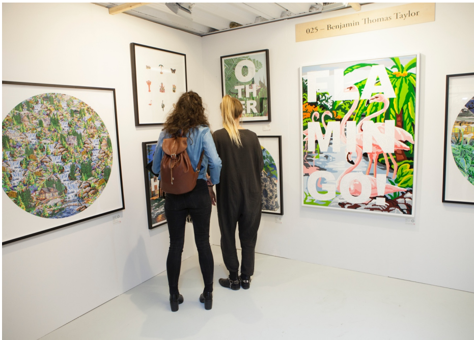
The Other Art Fair at Victoria House

The Other Art Fair, presented by Saatchi Art, has become one of the most important and exciting showcases for emerging artists. Unique in its approach, The Other Art Fair offers astute collectors the chance to discover and buy work directly from the rising stars in global contemporary art, with editions now in London, Bristol, Sydney, Melbourne, New York and Los Angeles.