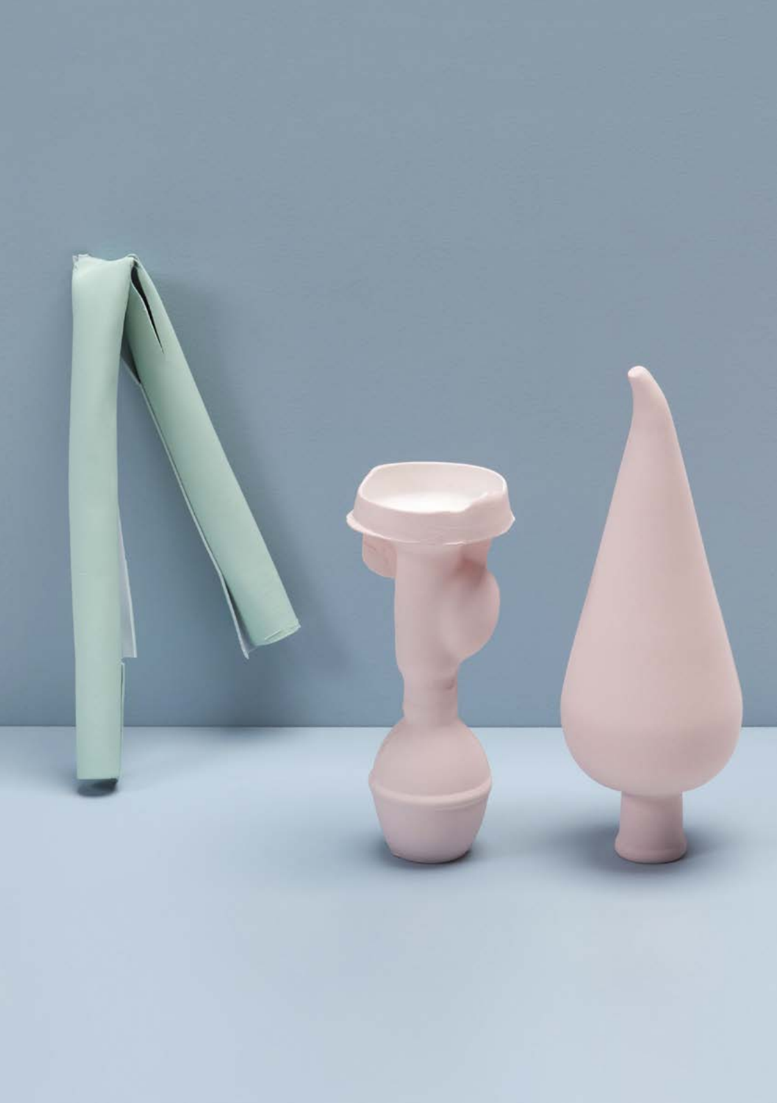
Anne Gibbs The Language of Clay Still