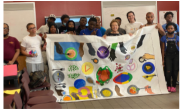
CITYarts and REACH x Frederick Douglass Academy 2022 collaboration; What Do You Bring to the Table