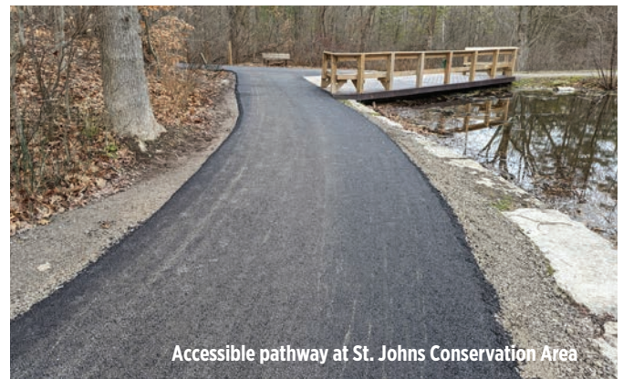
Accessible pathway at St. Johns Conservation Area

In 2022, Niagara Peninsula Conservation secured $750,000 in federal funding to improve green space and accessibility at six conservation areas: Ball's Falls, Binbrook, Cave Springs, St. Johns, Louth and Rockway. There is much more to do. You can make it happen.