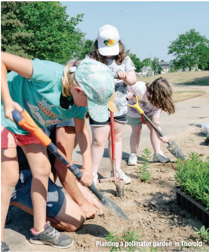
Planting a pollinator garden in Thorold