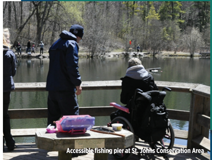
Accessible fishing pier at St. Johns Conservation Area

Demand for access to green space keeps growing. Every year, the call to get outdoors means more people with complex needs, including mobility challenges, are seeking out our sites. Upgrades are needed so that people of all abilities can enjoy the social, physical and mental health benefits nature provides.