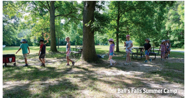
Ball's Falls Summer Camp