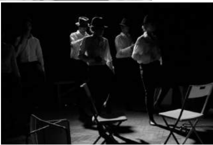
Tastes of Renaissance Short Performances 5 Kharkiv-based companies