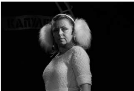
Romeo and Juliet William Shakespeare (Teatr Arabesky)