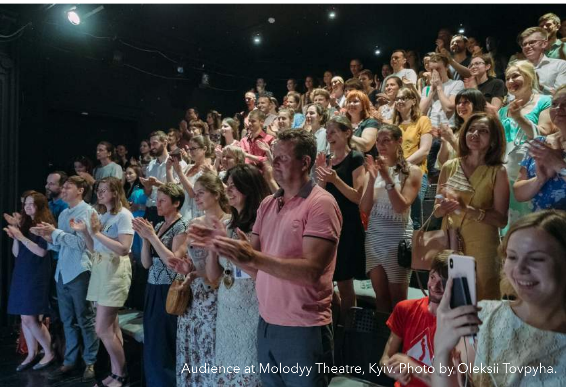
Audience at Molodyy Theatre, Kyiv.