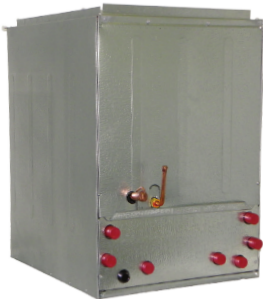
New StyleQuest Multi-Position Coil Patent Product