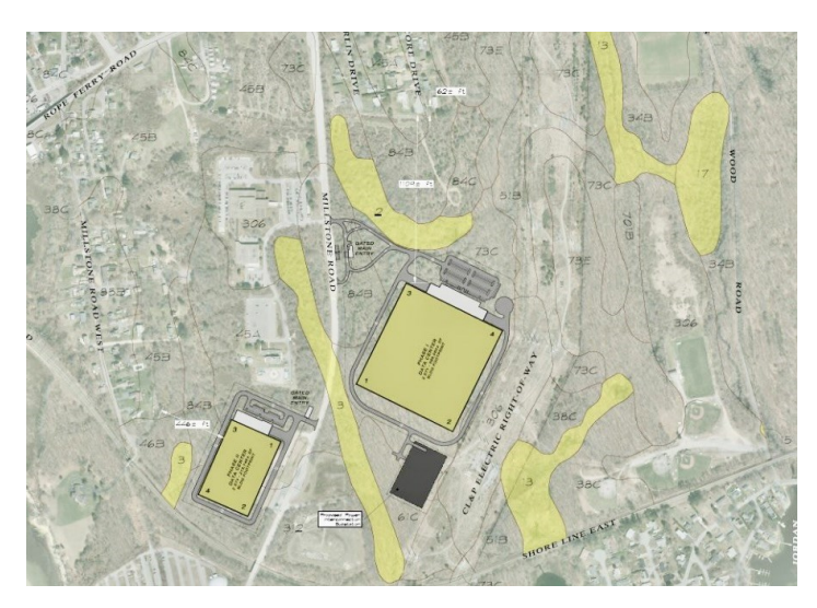
NE Edge proposed data center at Millstone in Waterford

Groton's public opposition and subsequent zoning changes. They have either dissolved or put their municipal host agreements on hold. Waterford is the latest town to pen such an agreement, proposing to locate the center at Millstone Nuclear Plant in order to draw power directly from the site. Groton's data center regulations and earlier public efforts are being leveraged in that community opposition, and may have contributed to an early hurdle: <a href="the state's siting council denied Dominion Energy's petition">the state's siting council denied Dominion Energy's petition</a> to cede evaluation and approvals to the town.