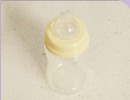
Bottles with teats and bottle covers

You need to make sure you clean and sterilise all equipment to prevent your baby from getting infections and stomach upsets. You'll need: