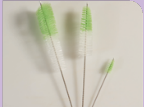
Bottle brush and teat brush