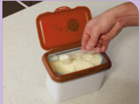
Infant formula powder or ready-to-feed liquid formula