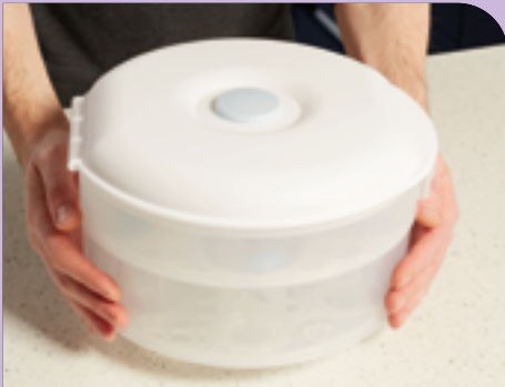
Sterilising equipment (such as a cold-water steriliser, microwave or steam steriliser)