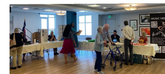
Westminster Amplify Austin Day Nonprofit Fair

They also asked how they could contribute and support the day financially. As a result, Westminster sponsored the first ever match in the "Senior Adults" Cause Category. Between the nonprofit fair and the match, Westminster generously made a lovely first year impact on Amplify Austin Day - and they are already planning again for next year!