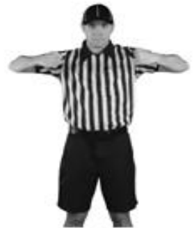
Face Off 2