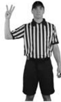
3 Minute Personal