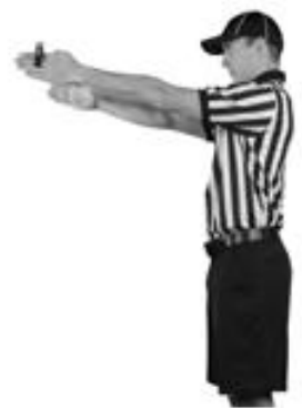
Team Time Out 3