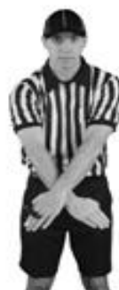
No Goal 1