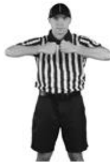
Face Off 1