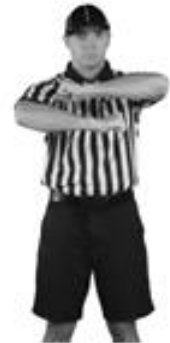
Illegal Procedure 3