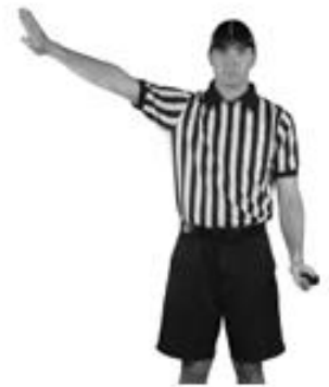
Warding Off 3