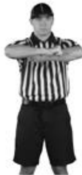
Illegal Procedure 2