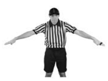
No Goal 2