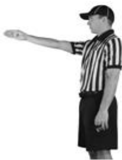
Direction of play