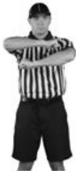
Illegal Procedure 1