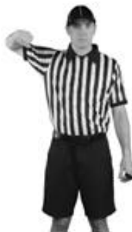
Illegal Bodycheck 1