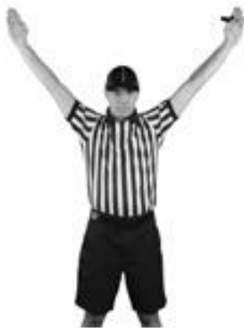
Time Out 1