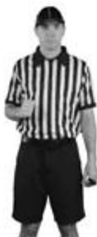
Illegal Bodycheck 2