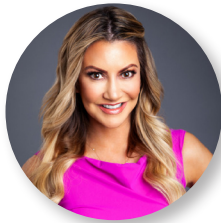
MISTRESS OF CEREMONIES