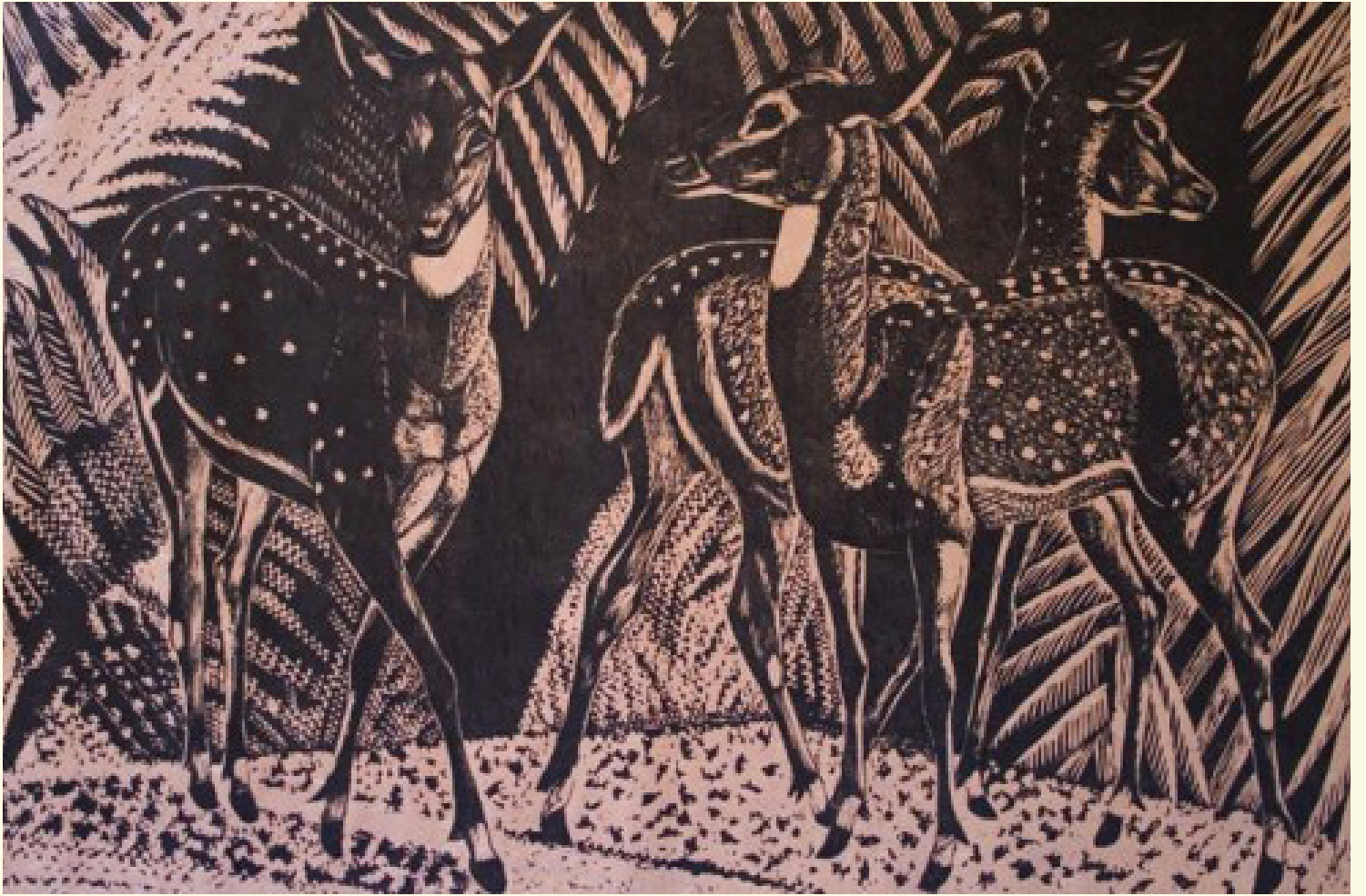
Spotted Deer of Ceylon