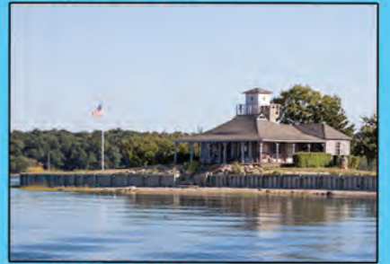
The Smith-Taylor Cabin