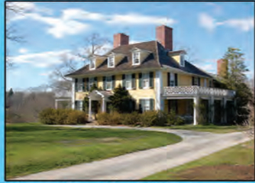
Sylvester Manor House