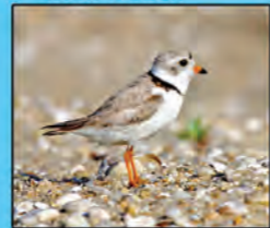
Piping Plover (Jim Colligan)