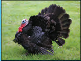
Wild Turkey