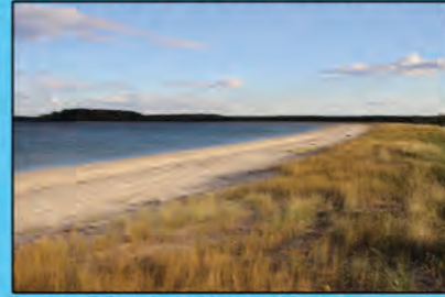
Section 9 Beach and Native Grasses