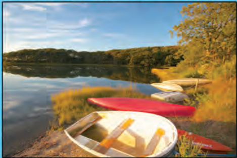
Crab Creek (Jim Colligan)