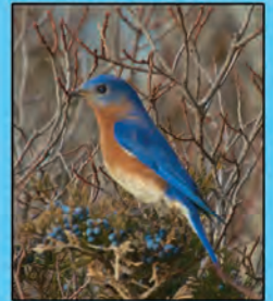
Bluebird (Jim Colligan)