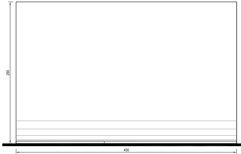
2 ELEVATION Scale: 1:30