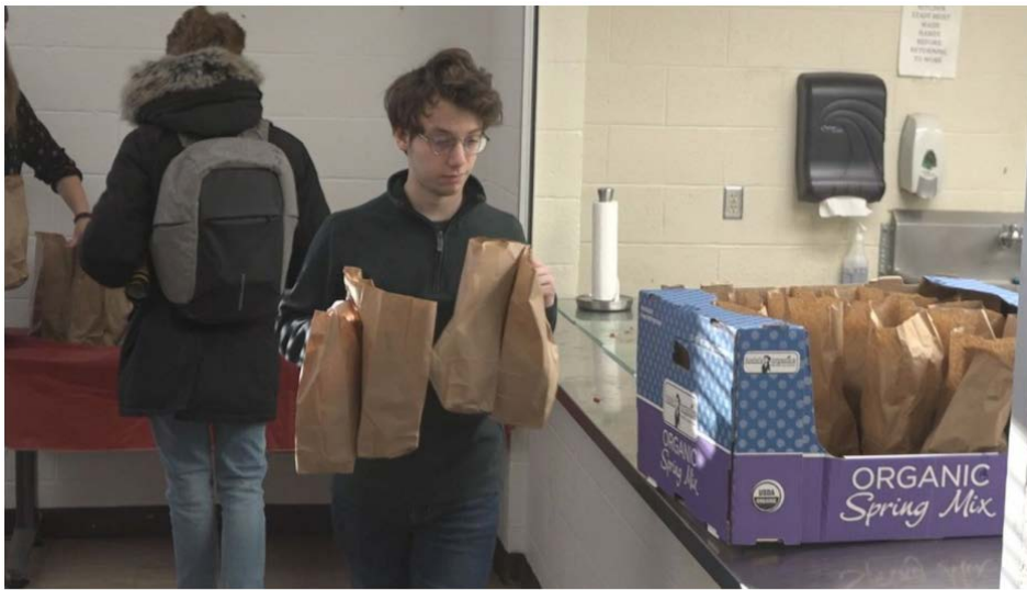
Students at the University of Iowa Hillel fill up boxes with meals to bring to the Shelter House on Monday, Jan. 20, 2020 in honor of Dr. Martin Luther King, Jr. Day.