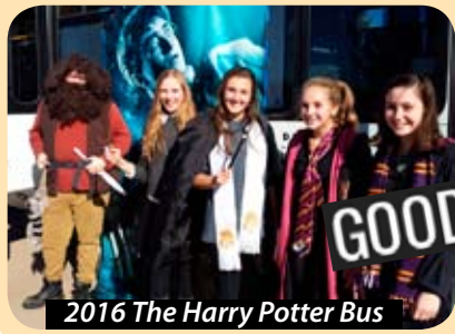
2016 The Harry Potter Bus

On Sunday, October 28 , all youth are invited to participate in the 9th annual Trunk or Treat from 2:30-4 p.m. We'll meet at 2:00 to decorate the bus. We'll brainstorm decorating ideas ahead of time and have the supplies needed to do so. Clean up will be at 4:00 while Youth Expressions meets. Youth will leave church for the hayrack ride at 4:30 sharp.