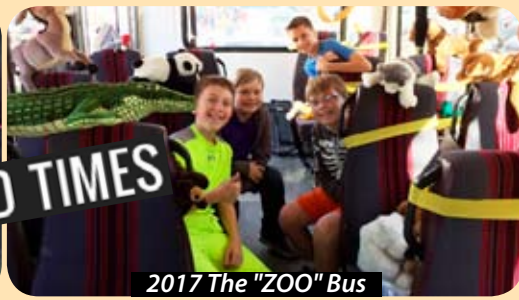
2017 The "ZOO" Bus