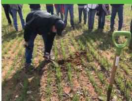
NRCS Soil Scientist Clay Salisbury at a recent field day in Eakly, OK

North, South, and West Caddo Conservation Districts, co-hosted an Introductory Soil Health Field Day on March 29 th near Eakly. Thirty-six people gathered to learn about the basics of Soil Health, Simple Soil Health assessment and tools, and the basics of incorporating cover crops into no-till systems.