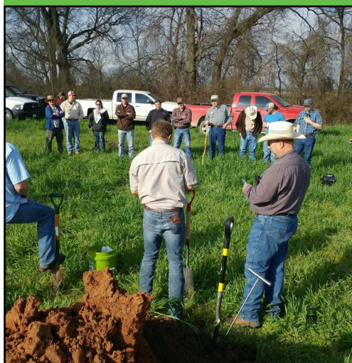
Attendees at the Kiamichi CD Soil Health Workshop