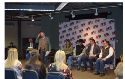
Sen. James Inhofe speaks at KNID AgriFest in Enid

Senator Inhofe spoke the AFR legislative breakfast along with other state ag leaders. Senator Inhofe spoke mostly on the Northwest Oklahoma Complex fires from 2017 and a piece of bi-partisan legislation he is working on so rural residents can be better served by federal programs following a disaster.