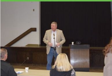
Rep. Frank Lucas speaks at KNID AgriFest in Enid

Farm shows and trade shows happen frequently across Oklahoma. But very rarely does the same show feature a local U.S. congressman and a sitting U.S. Senator. Congressman Frank Lucas and Senator James Inhofe, both Republicans, spoke at events during KNID AgriFest in Enid on January 12th.