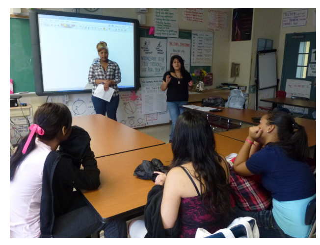
Student leaders at the Bushwick Campus give a workshop in conflict resolution to fellow students.

In a number of New York City schools, students, parents and educators are implementing positive approaches to discipline that hold students accountable for their behavior while keeping them in class. Positive discipline strategies such as restorative approaches, peer mediation and positive behavior supports reduce conflict and support student success by affirming the dignity and human rights of all members of the school community.