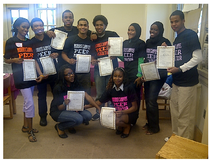
Students at Morris Campus complete their peer mediation training.

At the start of the following school year, school staff and community-based partners launched the Morris Campus Restorative Justice Project, which took on peer mediation training for students and restorative practices training for staff as their first initiatives to bring all four schools together. The peer mediation program began with weekly after-school trainings by The Leadership Program for roughly thirty students from the four schools on campus, which marked the first non-athletic collaboration between students from the different schools. The students who were trained as mediators formed the Morris Student Leadership Council with support from Sistas and Brothas United and Mass Transit Safety with Dignity. The goal of the Student Leadership Council was to plan out the implementation and promotion of the peer mediation programs in the respective schools and engage in broader discussions about school safety and restorative justice.