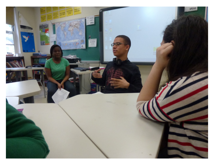
Student leaders at the Bushwick Campus give a workshop in conflict resolution to fellow students.

After the Student Leaders in Conflict Resolution program had built greater awareness and support for positive ways of responding to conflict on campus, the Restorative Justice Committee formed and began exploring different positive approaches to school discipline. Over the past two years, these committees have supported the four small schools on campus in establishing restorative school norms, justice circles and peer mediation, with each school taking its own particular approach to implementing positive school discipline.