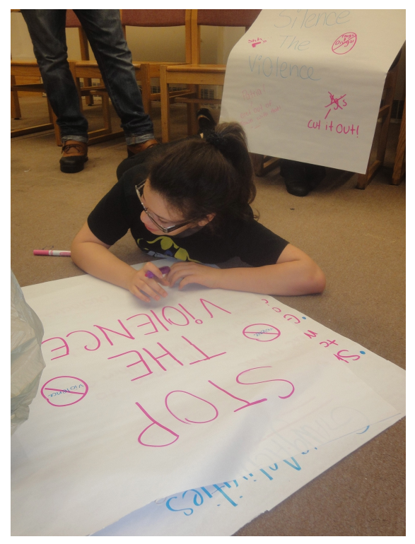
Students on the Morris Student Leadership Council planning their Talk it Out Campaign.

Despite the emergence of youth leadership and staff training in positive approaches, schools continued to face challenges, including violence. On one school day in February 2012, a misunderstanding between students at the different small schools led to an eruption of violence between students across the campus. Twelve students were arrested, and many more faced suspension. Following the fighting, the campus saw an increase in police presence and tension between the schools remained. Students continued to feel antagonized and students and staff alike had a deep-felt sadness about what had happened. Relationships and trust were damaged and the Morris Student Leadership Council felt the need to respond as a unified body.