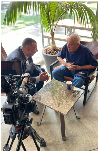
- Lt. Gen. Dan Halutz, former commander of the IAF and chief of staff of the IDF

Hamas, the organization that controls the Gaza Strip, is a terrorist organization linked to the Muslim Brotherhood and a number of western governments have declared it illegal to support Hamas by listing it as a terrorist entity. Nonetheless, the attack of October 7th with its brutal rapes, beheadings, burning of people and property, indiscriminate killings, and taking of hostages, far eclipsed any acts of terrorism Hamas has previously committed.