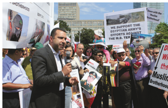
Majed El Shafie speaks at a protest advocating against the Muslim Brotherhood.

Never one to back down from an opportunity to stand against injustice, Rev. El Shafie has led high-level delegations to countries such as Ukraine, Armenia, Pakistan, Afghanistan, Iraq, Cuba, Israel, India, and Bangladesh, where he has met face-to-face with top government officials to open dialogue about these issues and often to confront officials with evidence of human rights abuses in their countries and the failure of their governments to address these issues. Some of his efforts have been documented in an award-winning feature film, Freedom Fighter.