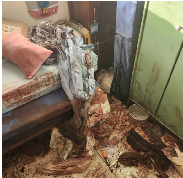
A child's blood-soaked room in Kibbutz Be'eri after the attack of October 7, 2023.

However, some principles are clear. Not only does proportionality not mean equivalence to the original attack, but the principle does not even relate to the original attack. Rather, it relates to the military objective of the party conducting the operation. This does not mean the original attack should be irrelevant – it often defines the military objective of the defender – but it is not the reference point against which proportionality of the response is to be measured.