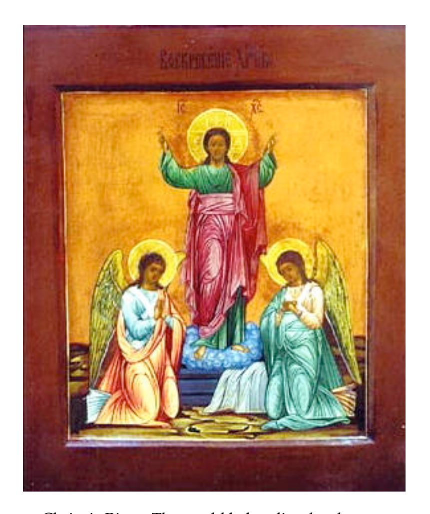
Christ is Risen: The world below lies desolate Christ is Risen: The spirits of evil are fallen Christ is Risen: The angels of God are rejoicing Christ is Risen: The tombs of the dead are empty Christ is Risen indeed from the dead, the first of the sleepers, Glory and power are his forever and ever. [Amen]