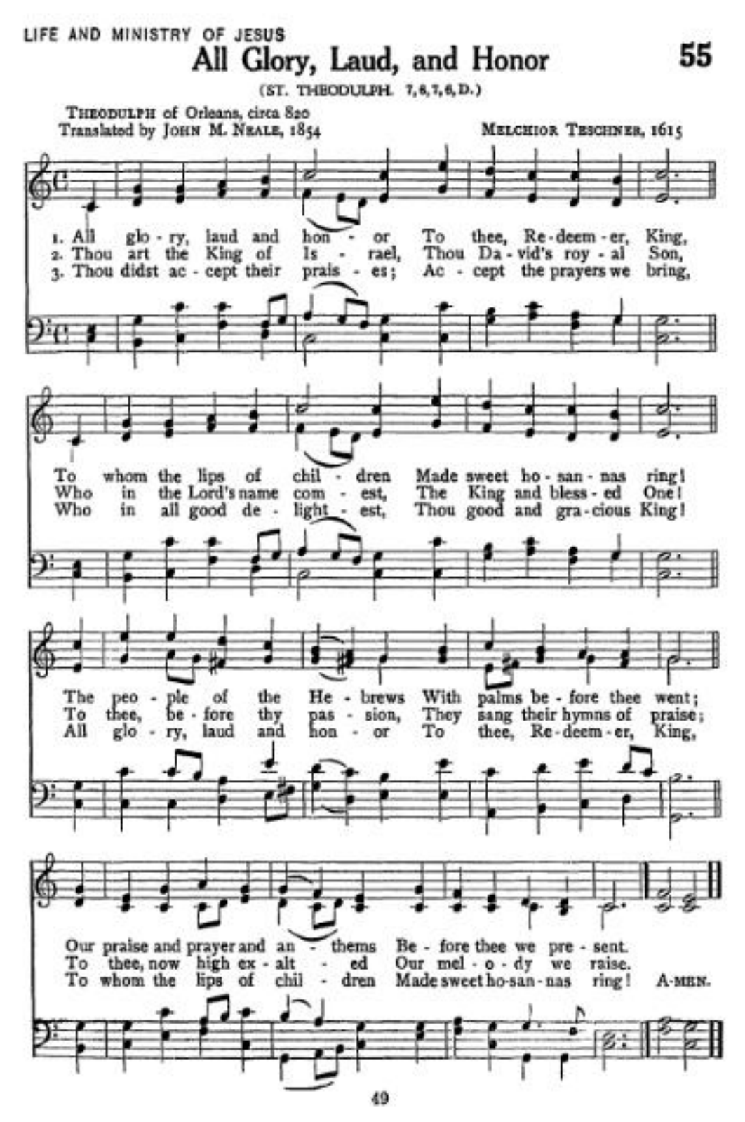
(Here's a link to a performance of this hymn: https://youtu.be/pHN8UAk6Yow)