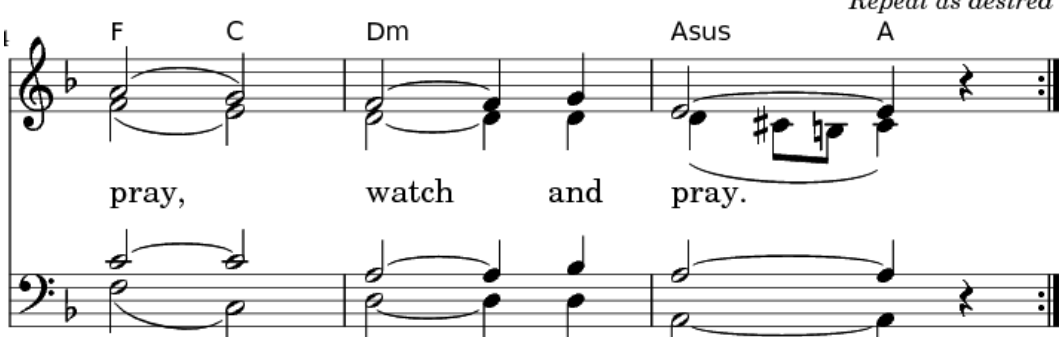
(Here's a link to the music: https://youtu.be/LmAOcHqvS0Q)