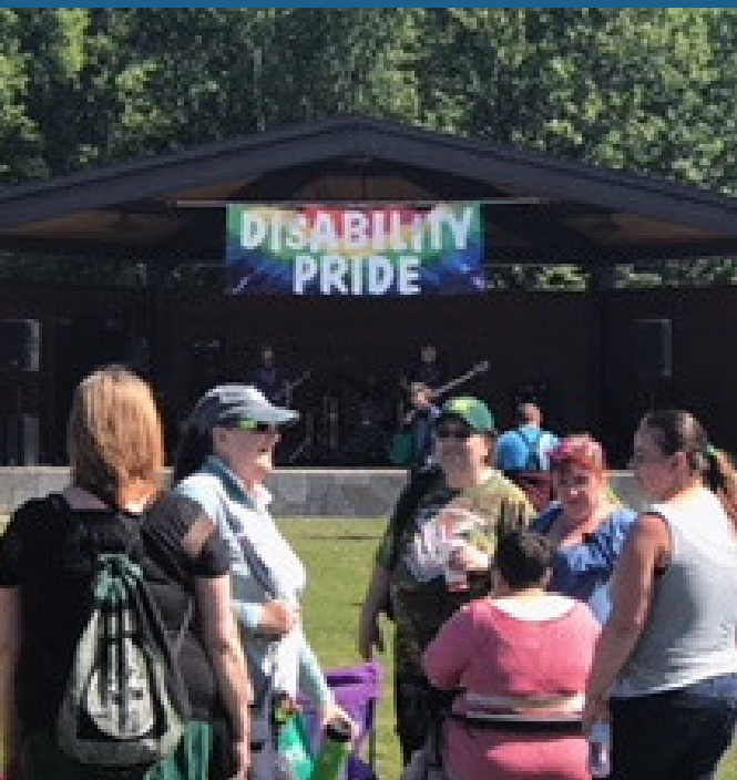
Disability Pride Celebration in Kenai

For the first time ever, Disability Pride events were celebrated throughout Alaska on July 21st commemorating the 28th Anniversary of the American's with Disability Act.