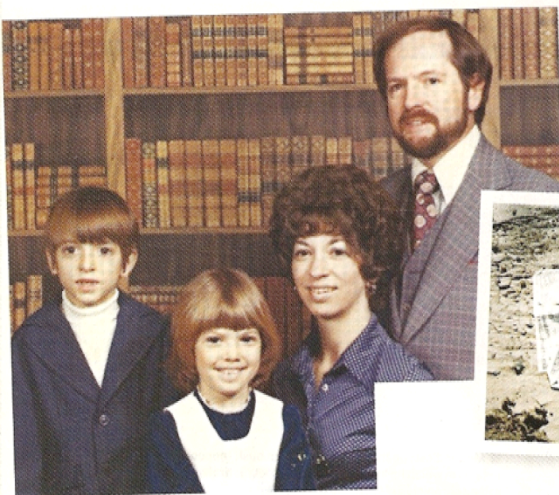
■ McCandless (above left, at age eight) grew up in a wealthy suburban Virginia family. After graduating college he gave away his trust fund and traveled through the West, burning his money in Arizona (top right). He eventually hitchhiked to Alaska (right).