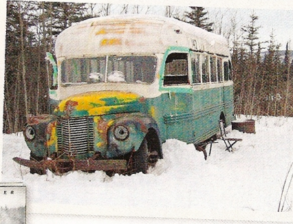
■ McCandless, posthum, in the Alaskan bush (opposite); the bus in which he lived for 109 days (above); Krakauer's best-selling chronicle of McCandless's odyssey.

It was a haunting tale, capturing the imagination of the country. September 1992, deep in the bush of the Alaskan interior northeast of Mount McKinley, in an abandoned bus on a disused mining trail, the decomposed body of a man was found by a moose hunter. The remains weighed only 67 pounds, and he had apparently died of starvation. He carried no identification, but a few rolls of undeveloped film and a cryptic journal chronicled a horrifying descent into sickness and slow death after 112 days alone in the wilderness. When the man's identity was established, the puzzle only deepened. His name was Chris McCandless, a 24-year-old honors graduate, star athlete, and beloved brother and son from a wealthy but dysfunctional East Coast family. With a head full of Jack London and Thoreau, McCandless rechristened himself "Alexander Supertramp," cut all ties with his family, gave his trust fund to charity, and embarked on a two-year odyssey that brought him to Alaska, that mystic repository of American notions of wilderness, a blank spot on the map where he could test the limits of his wits and endurance. Setting off with little more than a .22 caliber rifle and a 10-pound bag of rice, McCandless hoped to find his true self by renouncing society and living off the land. But, as Craig Medred would note in the Anchorage Daily News ,