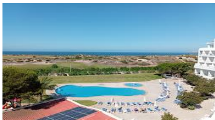
MH HOTELS – PENICHE