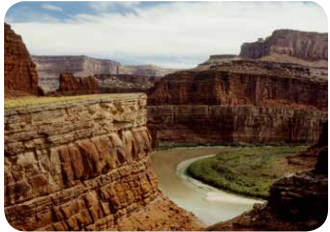
Dead Horse Point of the Colorado River in 1978.