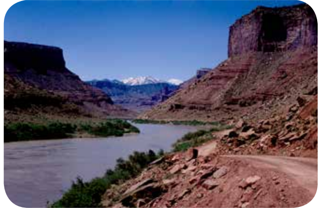
The Colorado River near Moab in 1969

But the fight is not over! The Lake Powell Pipeline has entered the federal permitting process, with the Draft Environmental Impact Statement due out within a year. Also, the funding appropriated for Bear River Development has fired up the many Utahns concerned about the Great Salt Lake and Wasatch Front air quality. Our opportunity to stop these projects once and for all is now. We will need all the support we can get to keep these nightmares from becoming a reality.