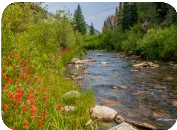
The Gooseberry Narrows Dam would inundate pristine cutthroat trout spawning habitat.

A proposed 120 foot-high dam and trans-basin diversion would spell disaster for aquatic species like native cutthroat trout that rely on the Price River and key tributaries Gooseberry and Fish Creeks. The Army Corps of Engineers is now deciding whether to issue a critical 404 wetland alteration permit for the so-called Narrows Project in Sanpete County. The URC has been fighting this proposed dam and diversion of Gooseberry Creek for 18 years and after decades of environmental studies and litigation this is one of the last federal permits proponents need to move forward with the Project. Continued on page 3