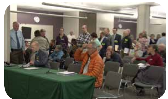
Over 100 concerned Utahns came to the water industry salesmen's home court to voice their concerns with the Lake Powell Pipeline

This came as a big surprise to Water Resources since these shadowy board meetings usually receive little to no public attention or oversight, yet the board routinely hands out millions of your tax dollars to divert rivers every year. Over 100 concerned Utahns came out to speak against these terrible river diversions. We would like to thank everyone who helped spread the word and came to the meeting!