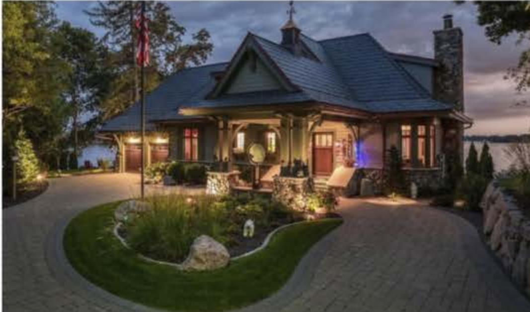
By Jeffrey Givens

Some or all of these elements may be present in a Craftsman home. If they are not employed properly (for example,