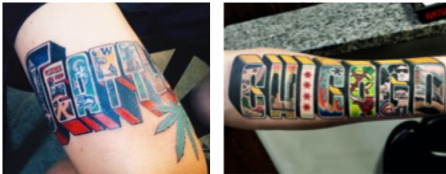
Locals proud enough to get tattoos of our murals (Seattle & Chicago.)