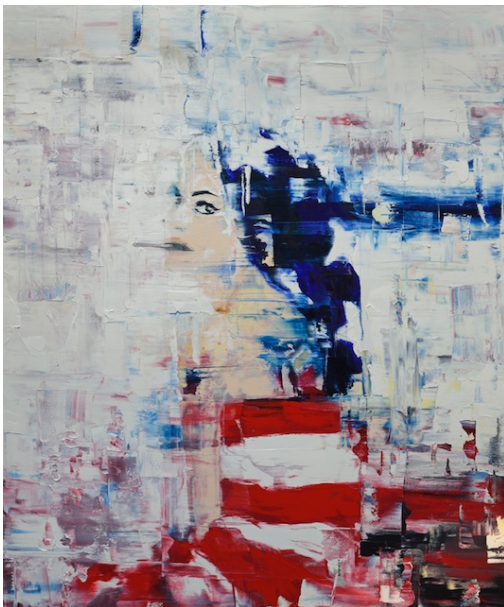
Untitled , 2017, Oil on canvas, 72 x 60 inches

In a series of eight new paintings, Michael Angel explores domesticity through portraits that were primarily inspired from photographs dating back to his youth. Although far from the total abstraction of some of his earlier works, the canvas scraping of his palette knife technique is still present and serves here to obscure and distort in order to distance the figures and unsettle a narrative of comforting home life.