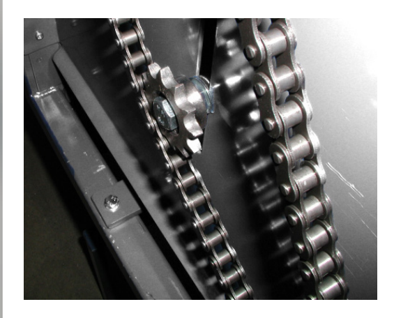
Our machines are built to last for 20 years.