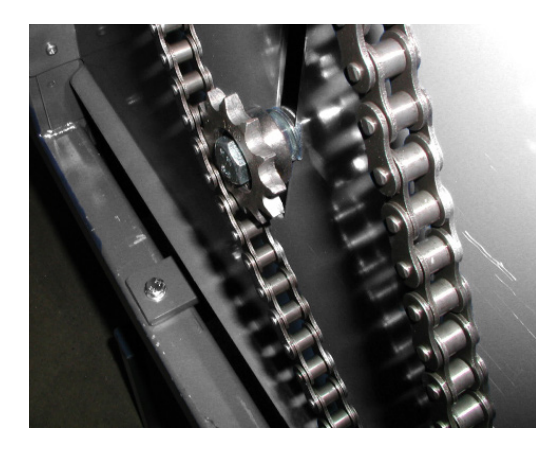
Our technology is built to last for 20 years.