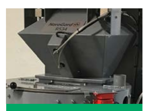
> The integrated scale allows you to vary the size of the batch