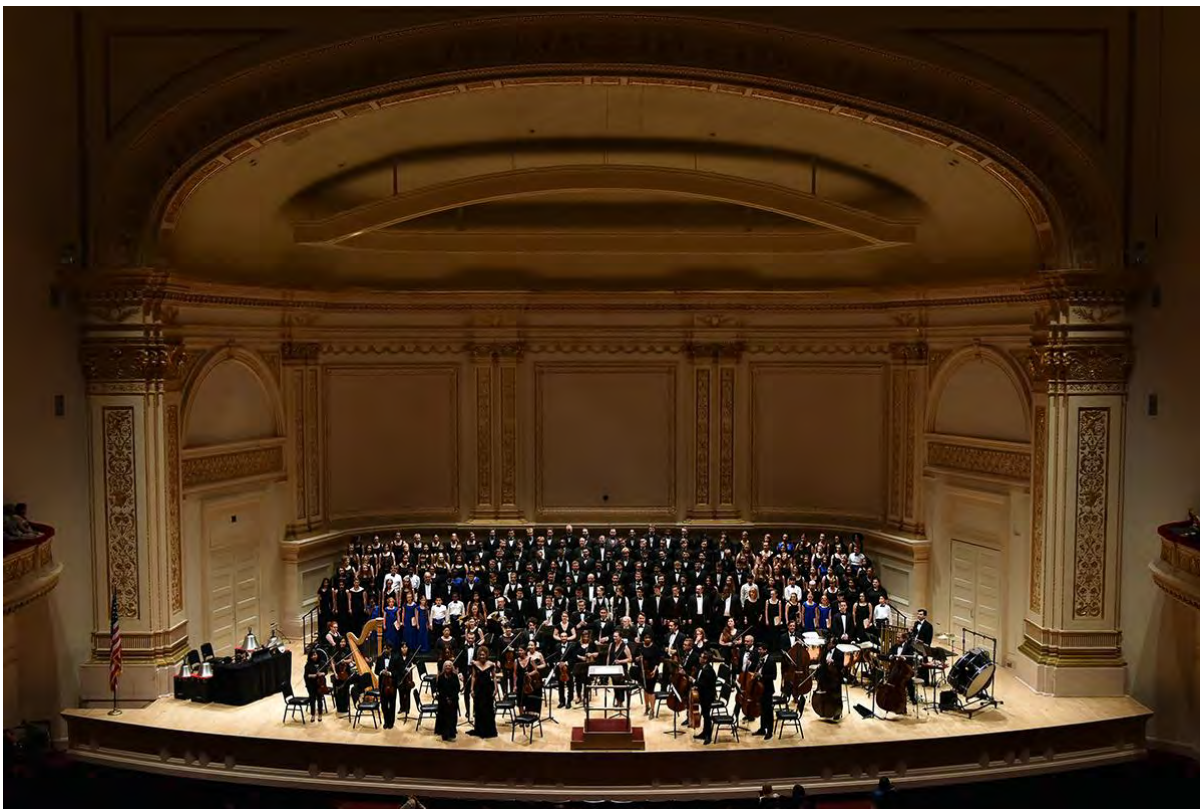
Performers take the stage in Carnegie Hall