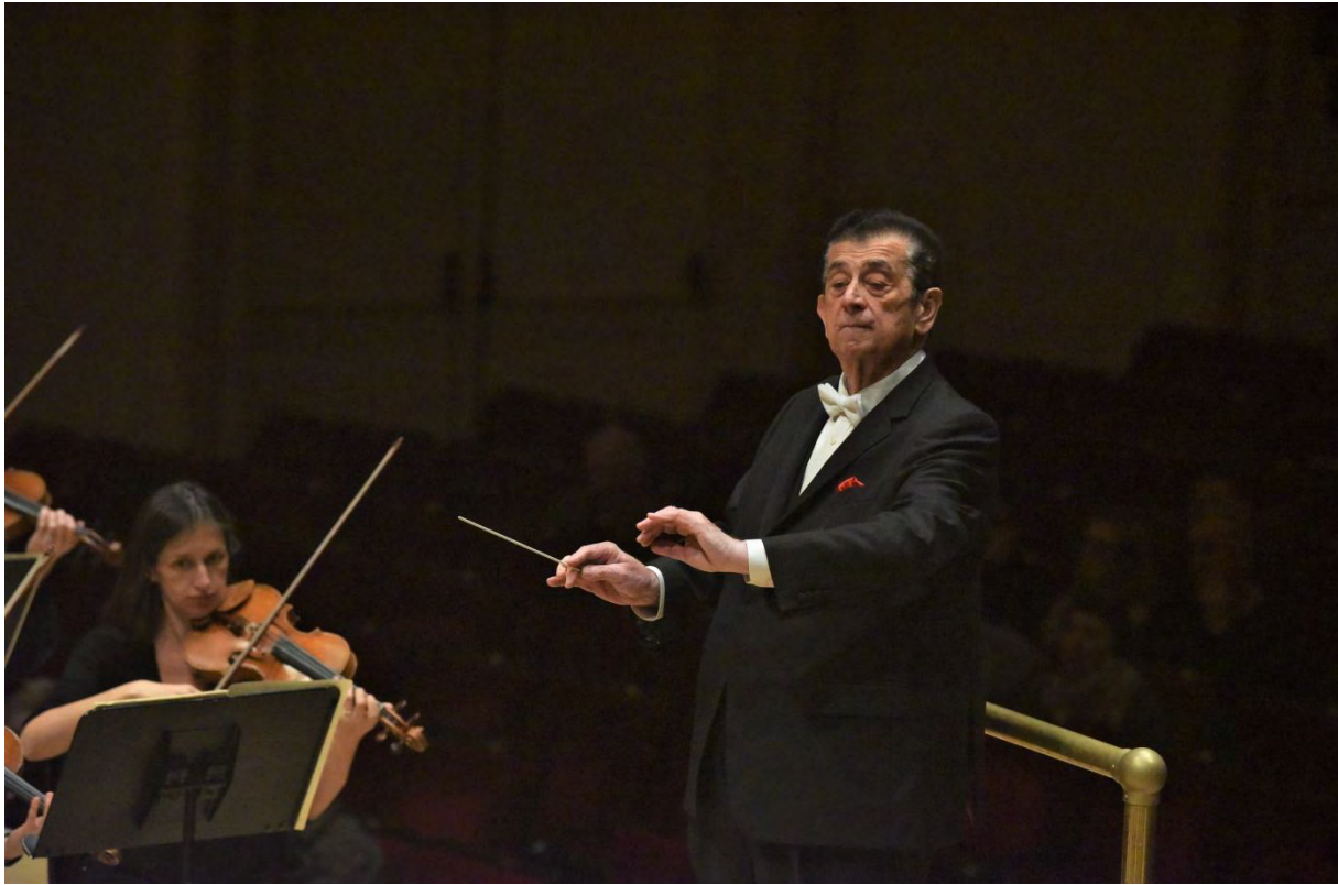
Peter Tiboris conducts Tchaikovsky's Symphony No. 5 in E minor, Op. 64 with the New England Symphonic Ensemble