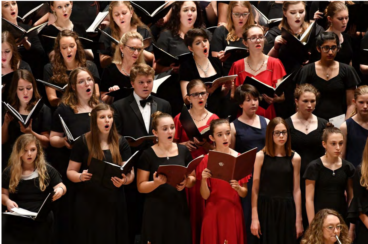
Choristers sing Mass of the Children at Carnegie Hall under the direction of Maestro John Rutter