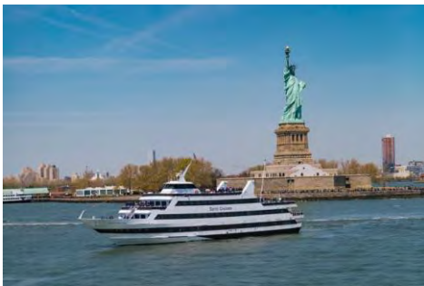
The Spirit of New York at the Statue of Liberty